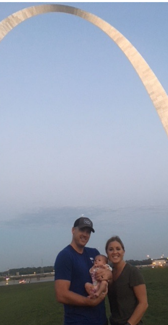
FIRST FAMILY VACATION- ST. LOUIS AT THE ARCH