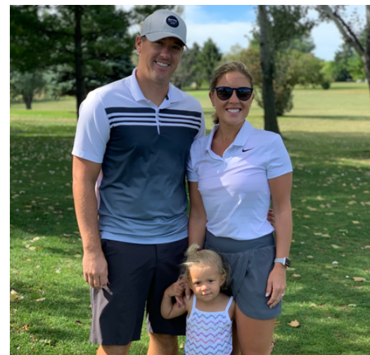
FAMILY GOLF OUTING!