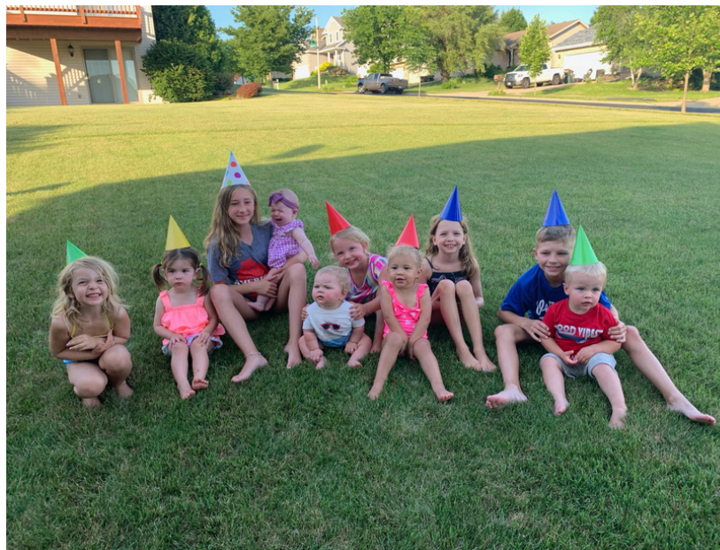
BIRTHDAY PARTY FUN