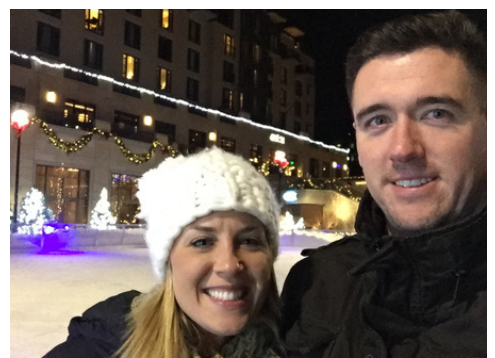
ICE SKATING ON KACI'S BIRTHDAY