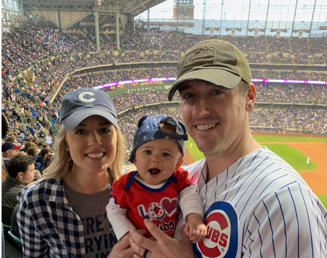
BERKLEY'S FIRST MLB GAME - CUBS VS. BREWERS