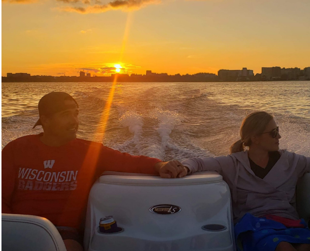
SUNSET CRUISE ON LAKE MONONA