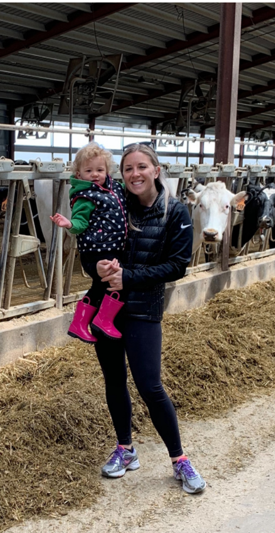
VISITING KACI'S FAMILY FARM