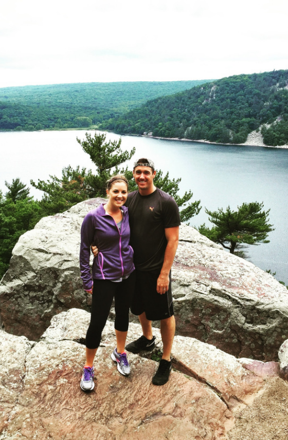
HIKING DEVIL'S LAKE