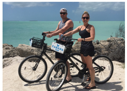
BIKING AROUND KEY WEST