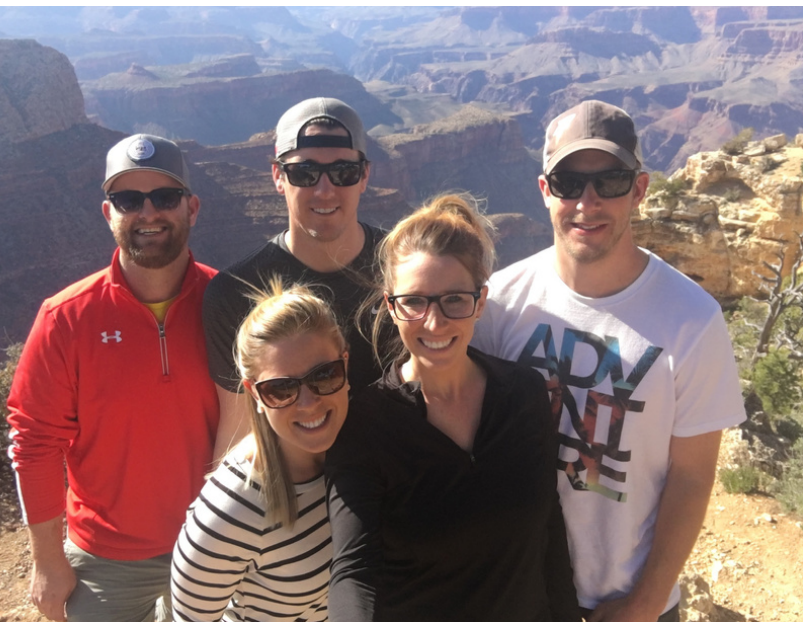
HIKING THE GRAND CANYON IN ARIZONA

We are a very social family and lucky to have a lot of good friends who live nearby. We spend a lot of time socializing casually at someone's house or bigger outings at events or weekend getaways. Most of our close friends are married and have children which makes getting together fun and easy for kids to play together. We have several Godchildren and enjoy babysitting to help friends or family out too.