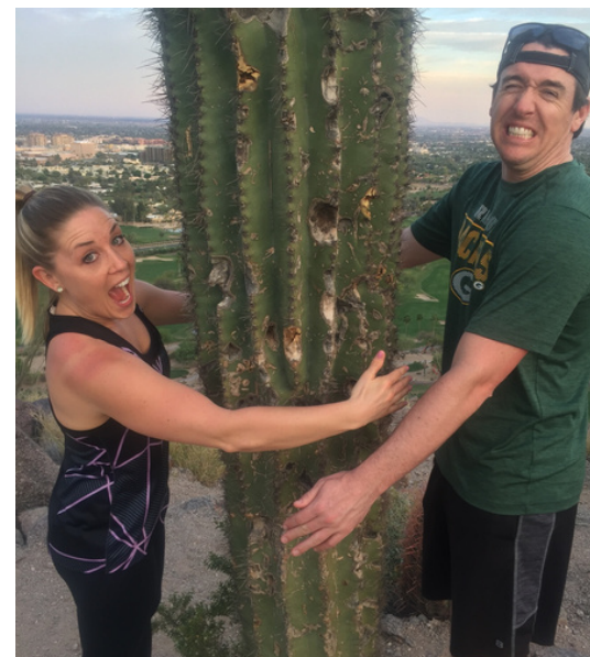
GOOFING AROUND ON VACATION