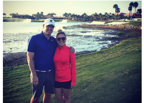
GOLFING AT PGA NATIONAL IN FLORIDA