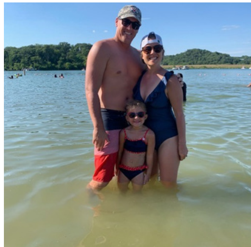
SPENDING 4TH OF JULY ON A LAKE