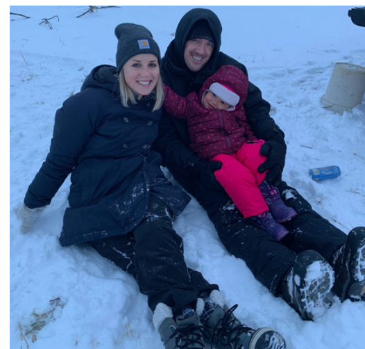
SLEDDING WITH COUSINS