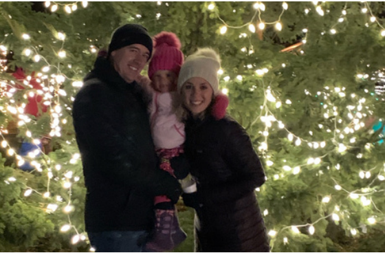
AT A HOLIDAY FESTIVAL