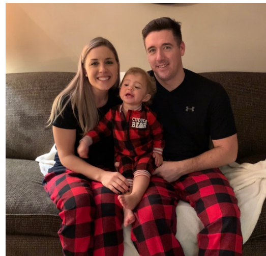
MATCHING CHRISTMAS JAMMIES