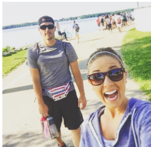
WALKING AROUND LAKE MONONA