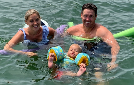
SWIMMING & BOATING AT THE LAKE IN KACI'S HOMETOWN