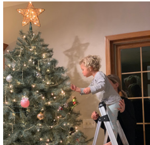
DECORATING THE CHRISTMAS TREE