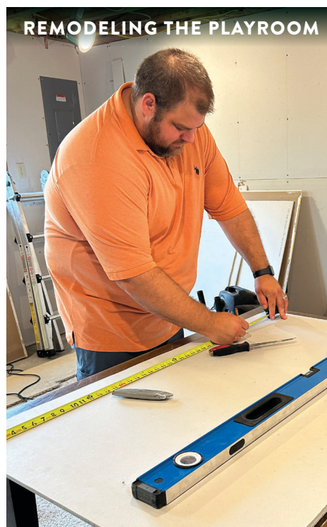
REMODELING THE PLAYROOM