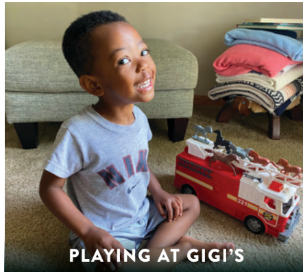
PLAYING AT GIGI'S