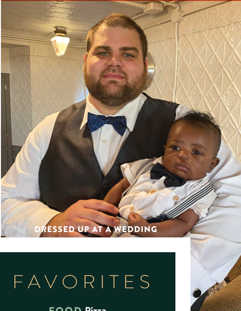
DRESSED UP AT A WEDDING