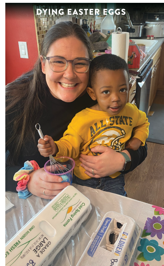
DYING EASTER EGGS