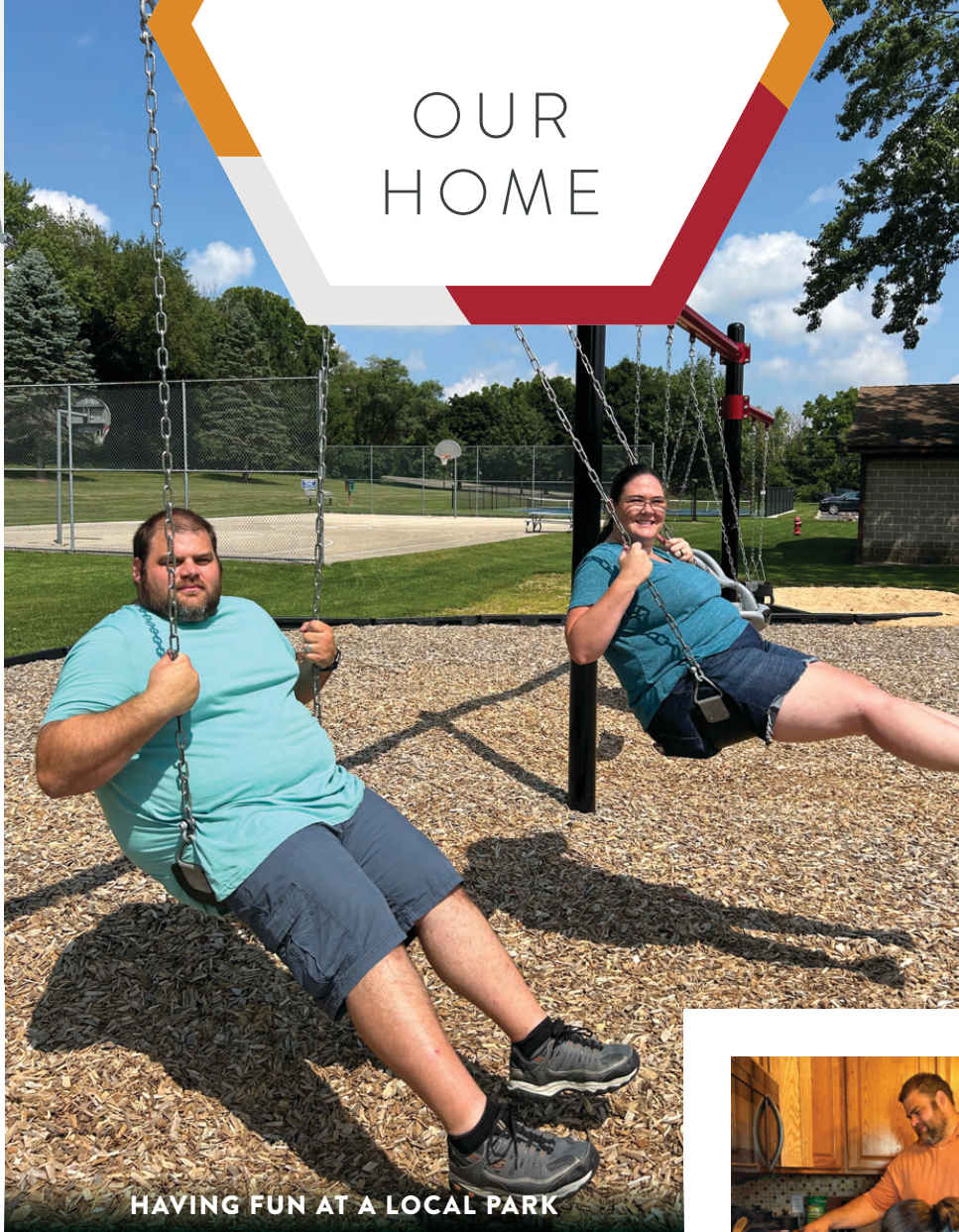
HAVING FUN AT A LOCAL PARK

We like to host get togethers and neighborhood bonfires. We are really close with our neighbors and there are lots of families with young children in our neighborhood. We live in a small community with several parks, a dog park, and a splash pad. There are a few small businesses we like to frequent including the local ice cream shop. We enjoy attending the community events including AppleFest, ChiliFest, and visiting a local farm in the fall. There are a lot of younger families and the Village of Deerfield is starting to develop and grow into a desirable community. Both of us grew up in small communities and we love the idea of raising children in the same environment.