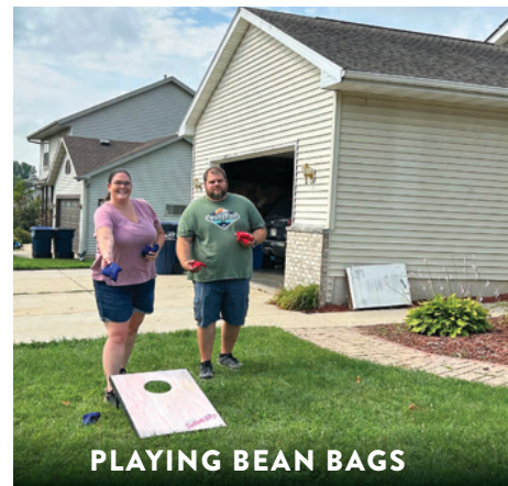
PLAYING BEAN BAGS