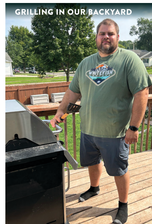
GRILLING IN OUR BACKYARD