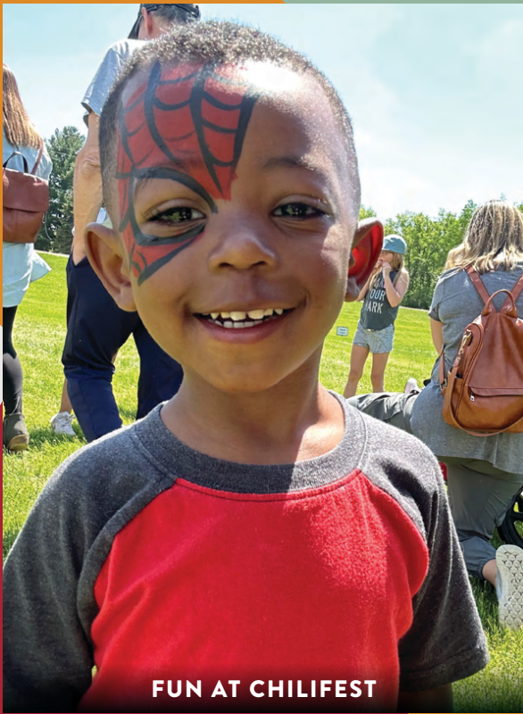
FUN AT CHILIFEST