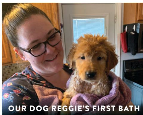
OUR DOG REGGIE'S FIRST BATH

SEASONAL ACTIVITY Decorating the Christmas tree