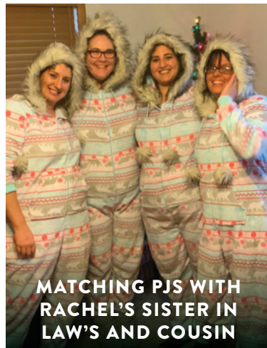
MATCHING PJS WITH RACHEL'S SISTER IN LAW'S AND COUSIN