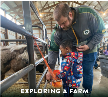
EXPLORING A FARM