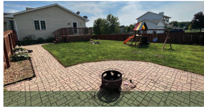
WE LOVE OUR BACKYARD!

WE LOVE SPENDING TIME AS A FAMILY IN OUR HOME AND ESPECIALLY IN OUR BACKYARD.