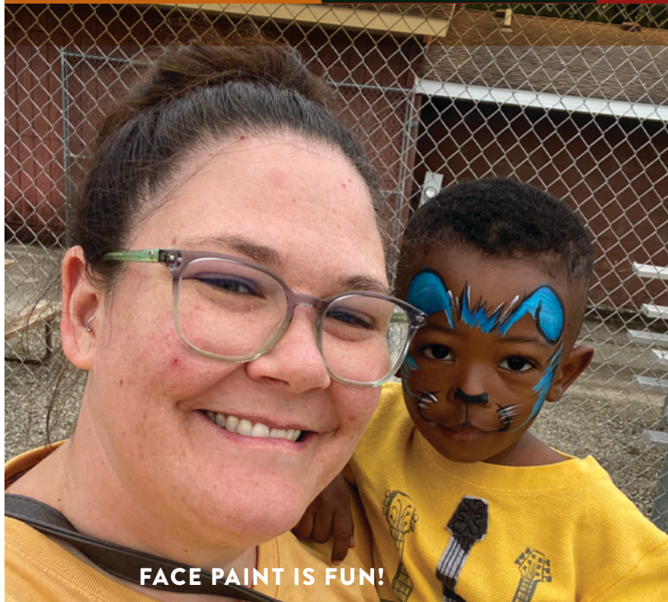
FACE PAINT IS FUN!