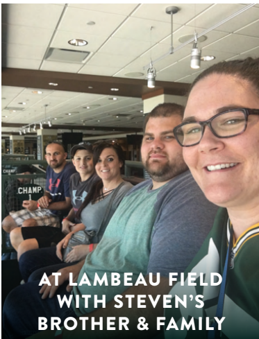
AT LAMBEAU FIELD WITH STEVEN'S BROTHER & FAMILY