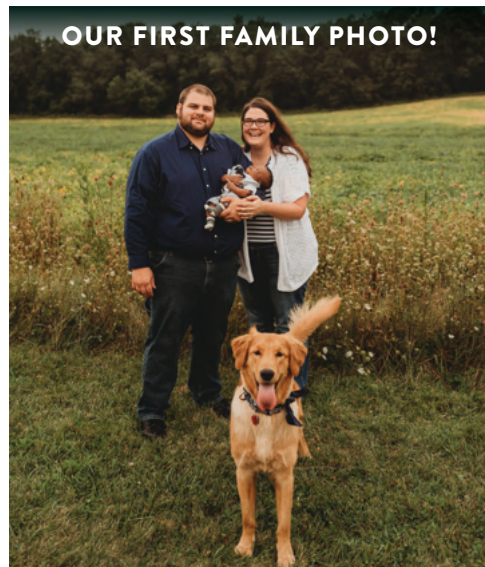
OUR FIRST FAMILY PHOTO!

For example, we have helped families in need over the last few holiday seasons. It is important to have an open mind and not judge other people's situations. Do what is in your power to help people and stand up for those that need it.