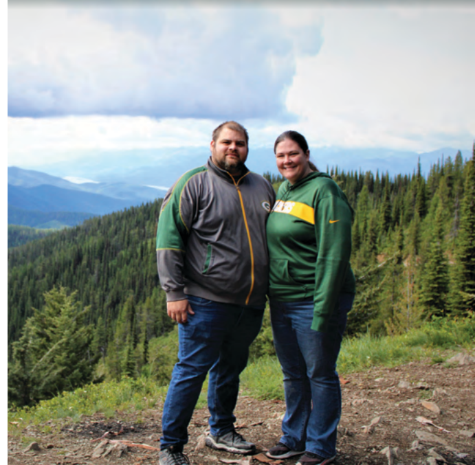
HIKING AT GLACIER NATIONAL PARK

TO TEACH them to be a strong, confident, and independent individual