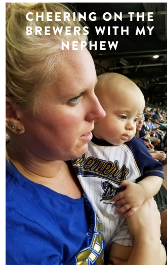
CHEERING ON THE BREWERS WITH MY NEPHEW