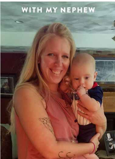
WITH MY NEPHEW