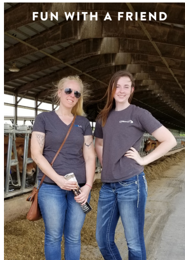
FUN WITH A FRIEND