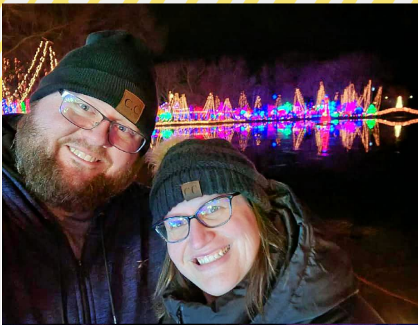
One of our favorite traditions - Lights at Rotary Gardens