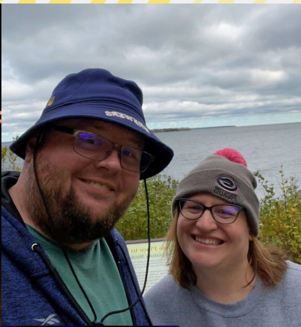
Our first trip to Door County, WI