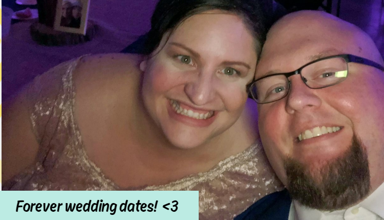
Forever wedding dates! <3