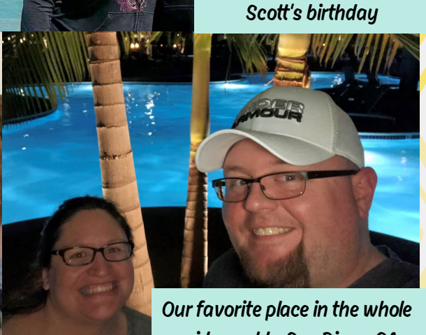
Our favorite place in the whole wide world - San Diego, CA