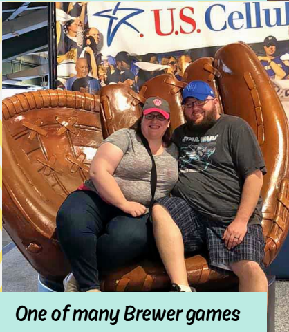
One of many Brewer games attended