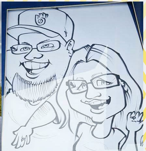
Caricature on our honeymoon in San Diego, CA