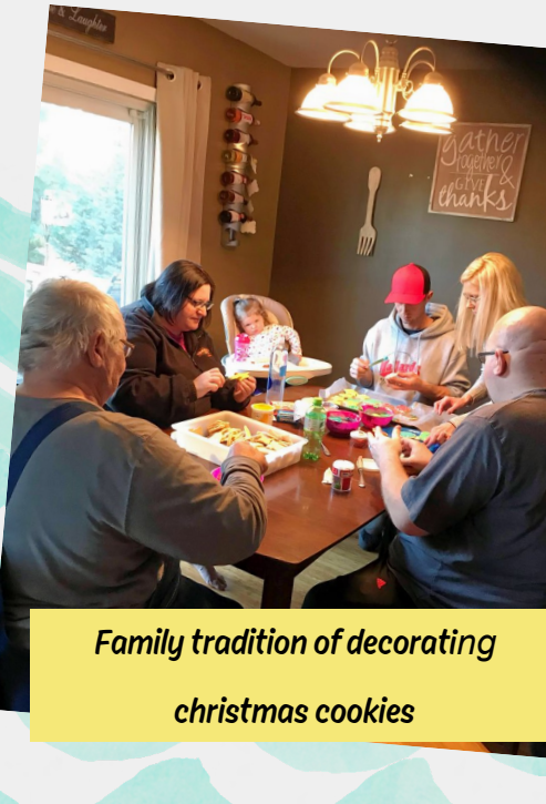
Family tradition of decorating christmas cookies