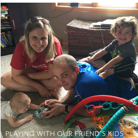
PLAYING WITH OUR FRIENDS KIDS