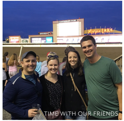
TIME WITH OUR FRIENDS

Our pup makes us laugh all the time with her crazy jumps and the funny ways she falls asleep on the recliner.