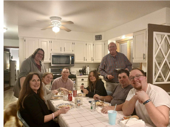
Thanksgiving at our house with both Families!