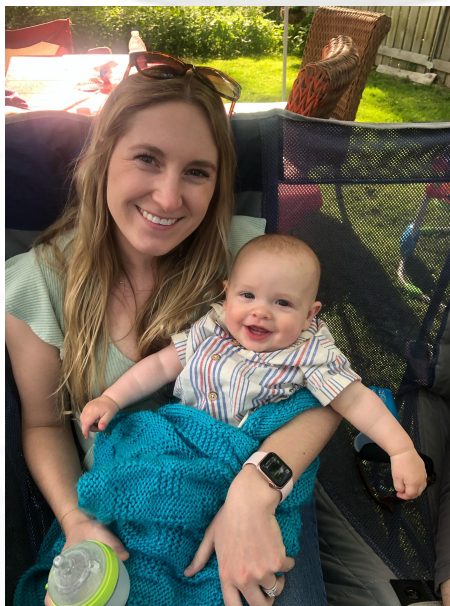
Hanging with the newest Nephew!