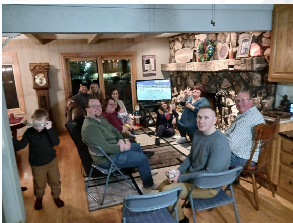
Packer party at Joey's Dad's house!