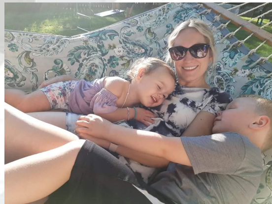
The Sweetest Snuggles!