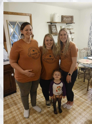
Hocus Pocus 2 watch party with Joey's sisters and niece at our house!