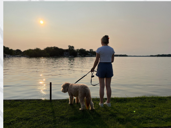
On one of our lake walks!