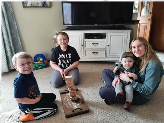
Serious Jenga Competition!