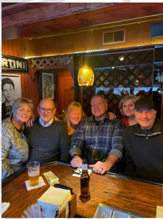
Ashley's parents out with her aunts and uncles. They call themselves "potato salad 6"