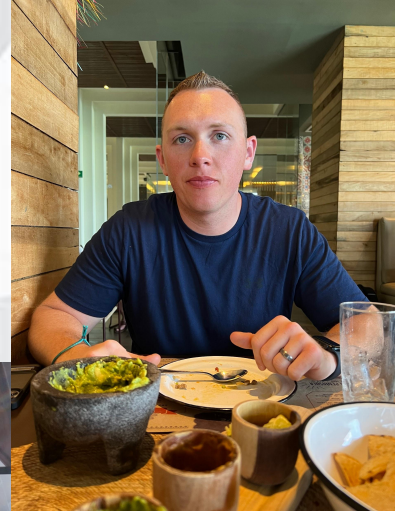
Trying to recover after too much spicy food during our stay in Mexico!